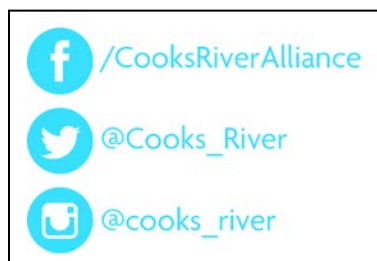
The Alliance on social media

The Alliance also made an exciting move into social media, following the finalisation of an Alliance Social Media Plan & Policy . The Alliance's presence on social media – including Facebook, Twitter and Instagram – works to create strong, engaged communities around the Cooks River. All member Councils were consulted in the development of the Plan & Policy , and implementation is carried out by all Alliance staff and integrated across all Alliance communications.