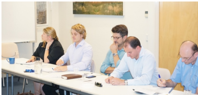
Catchment Stakeholders Meeting May 2014