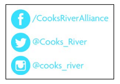
The Alliance on social media

The Alliance also made an exciting move into social media, following the finalisation of an Alliance Social Media Plan & Policy . The Alliance's presence on social media – including Facebook, Twitter and Instagram – works to create strong, engaged communities around the Cooks River. All member Councils were consulted in the development of the Plan & Policy , and implementation is carried out by all Alliance staff and integrated across all Alliance communications.